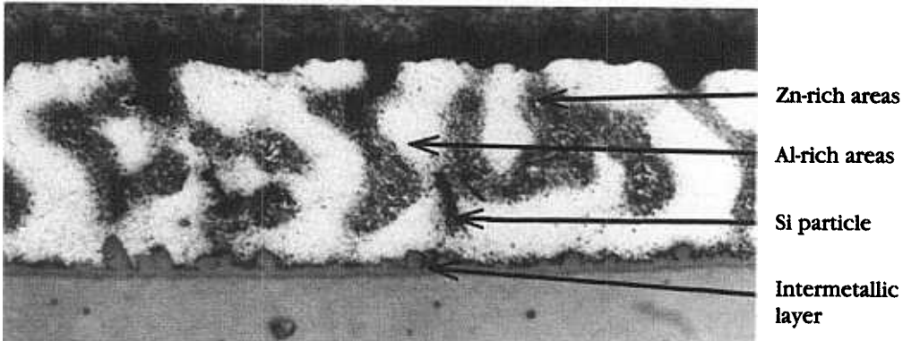
Figure 1: ZINCALUME® Steel Microstructure

A typical microstructure of the alloy coated steel is shown in cross section in Figure 1. The structure which forms on cooling is essentially two phase, comprising about 80% by volume of an aluminium rich phase and the remainder a zinc rich phase with a thin intermetallic layer next to the steel substrate.